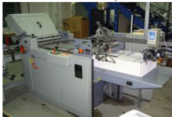
STAHL Folder (1999)

Stahl Ti52/4/4F /T Folder Flat Pile Feeder With Tremat Head, 4 Plate First Unit, 4 Plate Second Unit, Integrated Batch And Total Counter