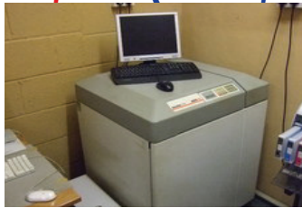
AGFA Accuset 1200 CTP (1994)

Imagesetter, Glunz and Jensen Film Processor, Epson Proofer, Apple Mac G5 With Quark and InDesign