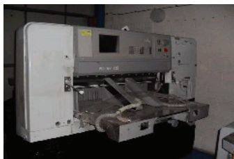
POLAR 115E (1999)

Polar RA4 Jogger, 2x lifting and lowering capabilities, LW100 Stack lifts