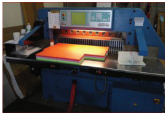
Schneider I 15 EL (1998)

Schneider Senator E-Line, Programmable Interface With Air Bed And Light Beam Safety Guards