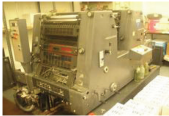
HEIDELBERG GTO-52 (1997)

Printmaster GTO-52, DDS Dampening, Standard Clamps, BC-220 Register System, Single Sheet Feeder, Standard Low Pile Delivery, Weko T6 Powder Spray, Minus Version