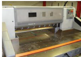
Polar 78 E (2001)

Polar 78 With Integrated Screen, Light Beam Safety Guards, Programmable With Air Bed and in general good condition