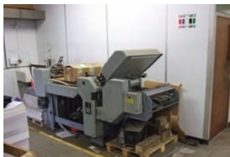
STAHL T (1998)