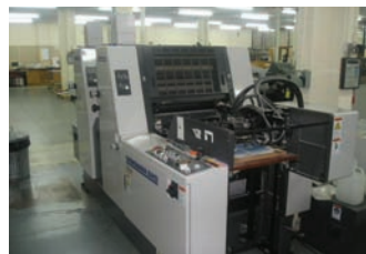
Muller Martini 1509 (1996)

6 Section Feeders, Cover Feeder, Twin Head Stitching Unit, 3 Knife Trimmer, Shingle Delivery, 3000 - 5000 CPH