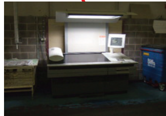
HEIDELBERG Image Control (2002)

Scans Printed Sheet, Automated Quality Control For Printing, Connects via Dedicated Cable To CP2000 Console or with Additional Module to CPC 1-04 Console